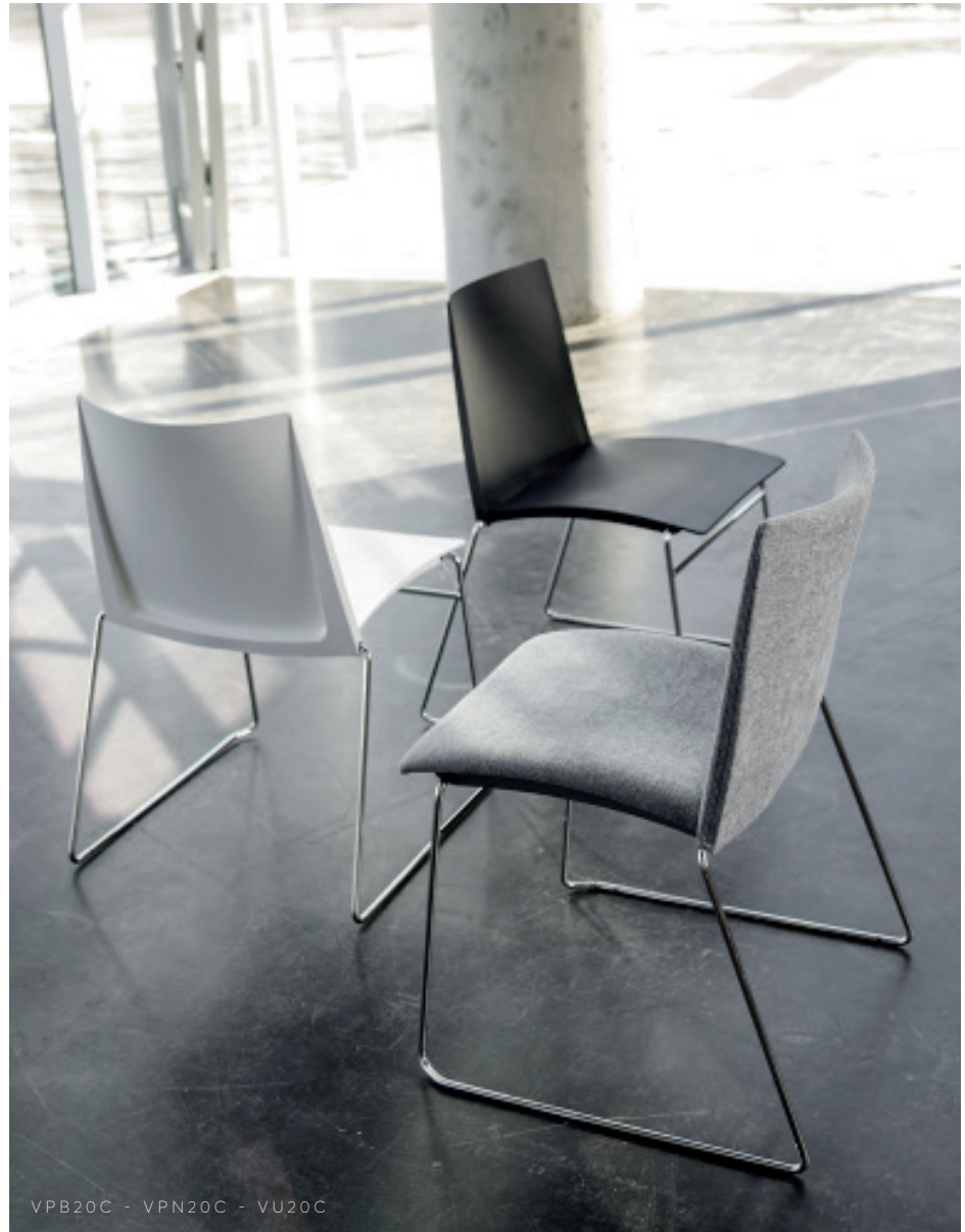
VPB20C - VPN20C - VU20C