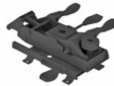
PFG MECHANISM Multifunction