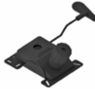
P5 MECHANISM Conference